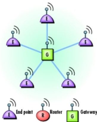
Figure 1. Start WSN topology

Star network: in this case the network is formed by a central element, in charge of controlling the network, which receives the information from wireless sensor end-point nodes. These are physically similar to the mesh network nodes. The end-point nodes send data directly to the central coordinator. From there, data is relayed to other systems. Star networks offer the fastest data gathering speed. The star network topology is typically used in Body Area Networks (BAN), also called Body Sensor Network (BSN) [3], where sensors are located on the body of a person.